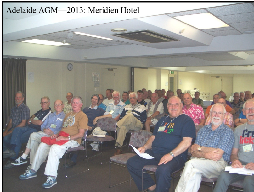
Adelaide AGM—2013: Meridien Hotel

And while on the thanks ..... Thank you to all those members who attended another very successful AGM gathering, this time held in the City of Churches (and synagogues as was pointed out at the meeting) Those members are well aware of the "hiccup" that occurred on the Friday night. Despite the bit of drama (and stress) at the time, it certainly showed