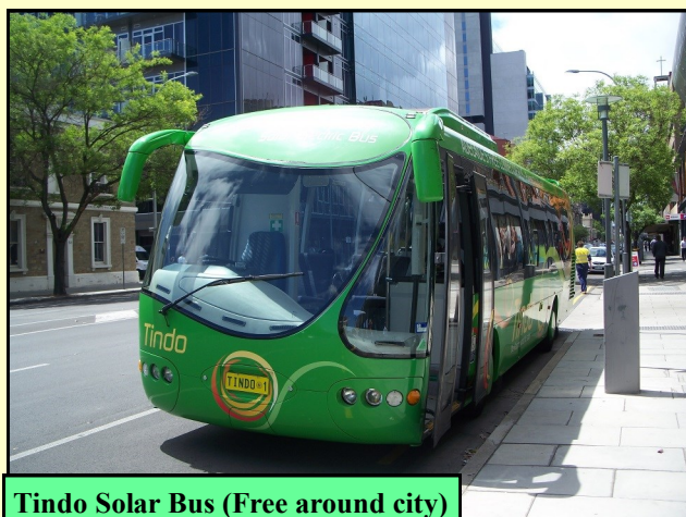
Tindo Solar Bus (Free around city)