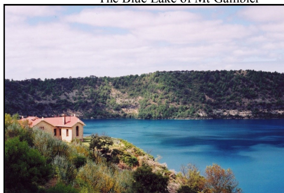
The Blue Lake of Mt Gambier